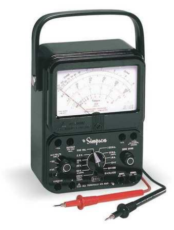
Fig.8 Simpson 260 - analog multimeter

Elenco multimeter or digital multimeter is often used because of its simplicity and better precision. In theory, an analog meter or Simpson 260 can carry out the same measurement in voltage, current and resistance. Analog meters use needle reading instead of digital display, so there is always additional human (reading) error involved. Because a digital meter has high input impedance of 10M\Omega , which is often at least 50 times higher than that of an analog meter (for example 20k\Omega/volt in DC, 5k\Omega/volt in AC), it provides much less loading effect and much better precision. The benefit of analog multimeter is sometimes it provides easier visualization. For applications where precision is less important, such as debugging an open or closed circuit, an analog meter provides more direct telling of such operation. On the other hand, improper use of digital meter may tell a lie instead. Analog meters with higher precision also do exist, but are usually much more expensive and hard to come by. That's one of the main reasons that digital multimeters are far more widely used than analog multimeters.