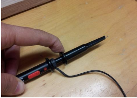
Fig.4 10x probe