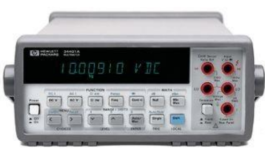
Fig.2 HP34401A (Located in E80 lab and VLSI lab)

The best way for AC voltage measurement is using an oscilloscope. It always tells truth of the signal without assumption of the waveform.