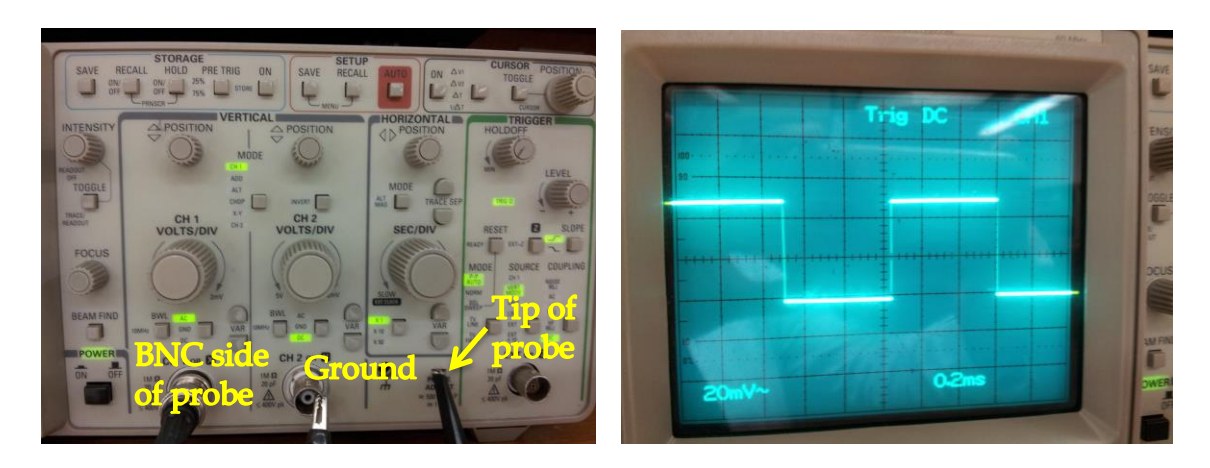
Fig.5 Setup of probe during tuning and properly tuned square wave