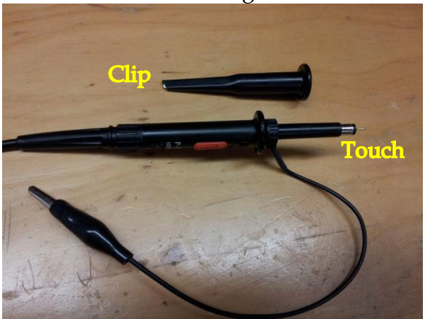
Fig.7 10x probe with tips to touch or clip

• For easier and stable probing, add wire at the testing point on breadboard for good gripping. If you only need to touch or contact with small pin such as IC pins, remove the probe hook as shown in Fig.7.