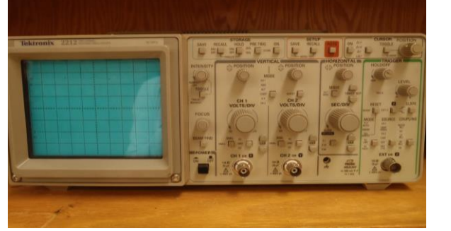
Fig.3 Tektronix 2212 Oscilloscope

The best way for AC voltage measurement is using an oscilloscope. It always tells truth of the signal without assumption of the waveform.